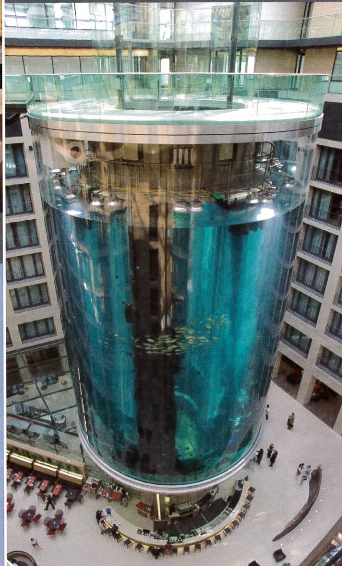
Aquarium lift at Radisson Blu Hotel, Berlin - Germany