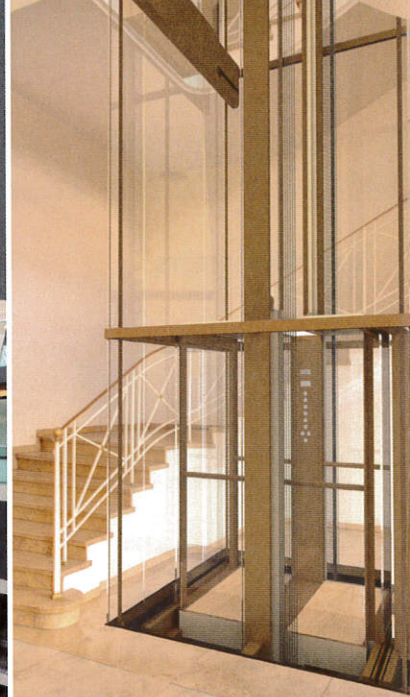
Commercial Building, Munich - Germany Private Villa, Lagos - Nigeria